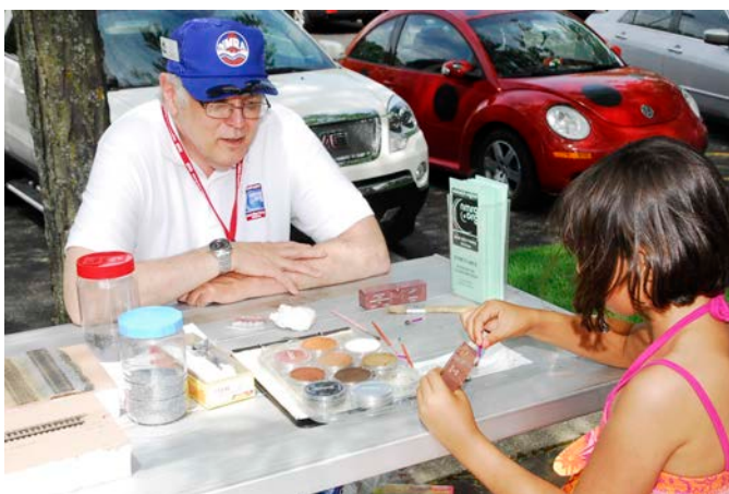
All Flimzie photos courtesy of Joe Whinnery