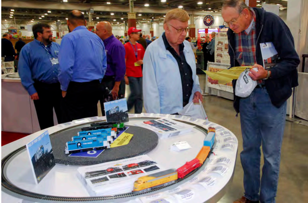
...checking out the Athearn display...