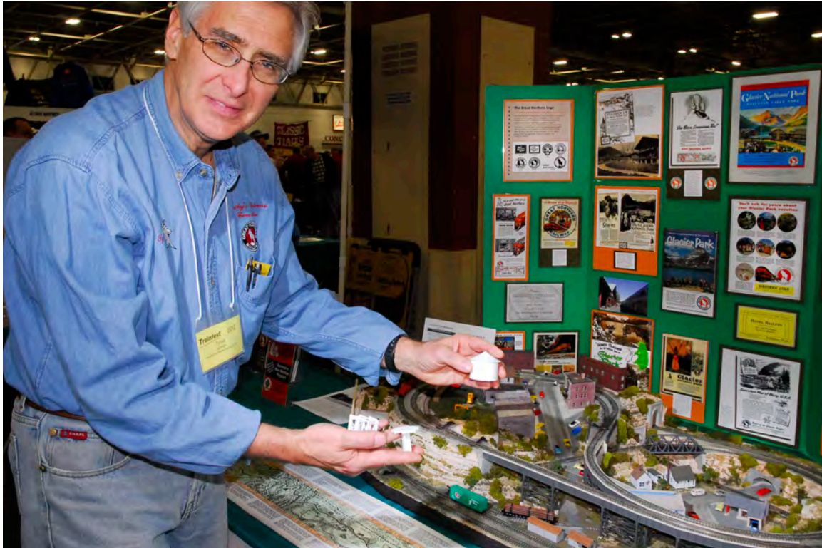
... taking a closer look at the Great Northern Railroad