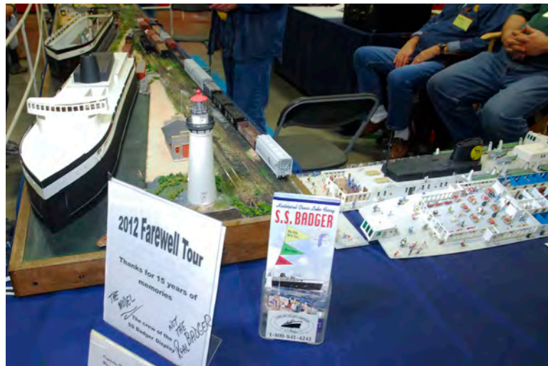
SS Badger Display at Trainfest

I will be set up to take orders during the Garage Sale on December 2 nd . You may also email or call me, but, I will need the money before I will place your order. My phone number is 815-877-3390, or you can email me at nycfan1@comcast.net .