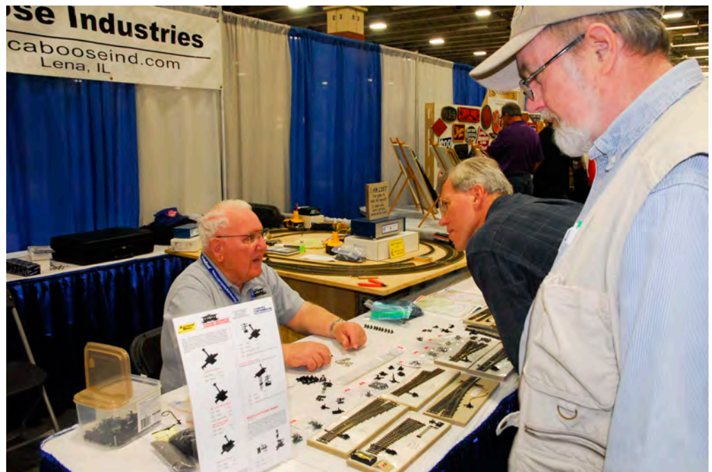
...visiting Caboose Industries.....