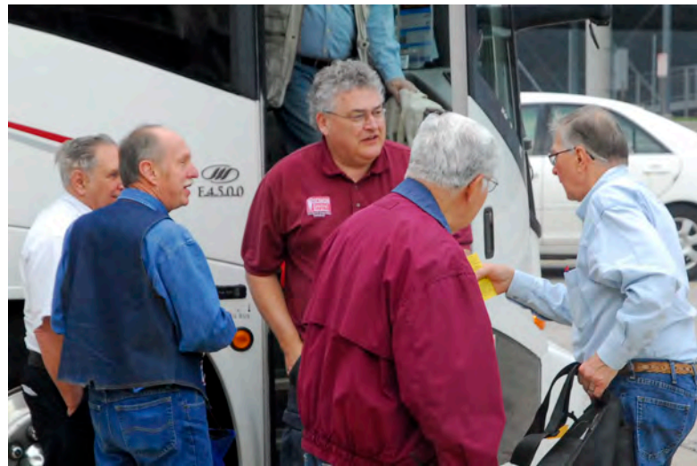
RRVD Members getting off the bus and heading into Trainfest 2012.